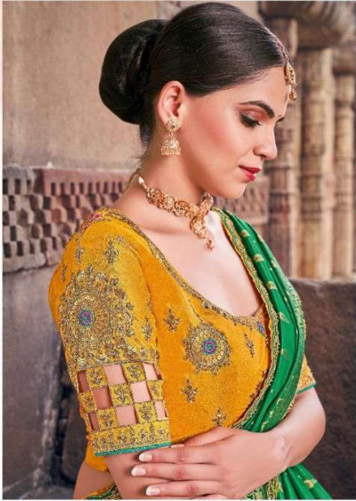
There is a wonderful garment that elegantly flatters the curves of a woman