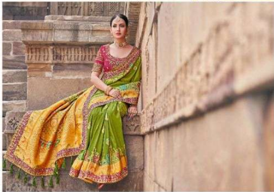
From is a piece and You will into a room wearing a saree and you know what the room was talking about it's a "co-polya" thing.