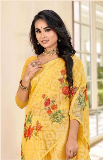
Renew a pure delicacy to the eyes around you with this alluring drape. Make this exclusive traditional Indian saree with contemporary modern designs and exceptional feel your prized possession