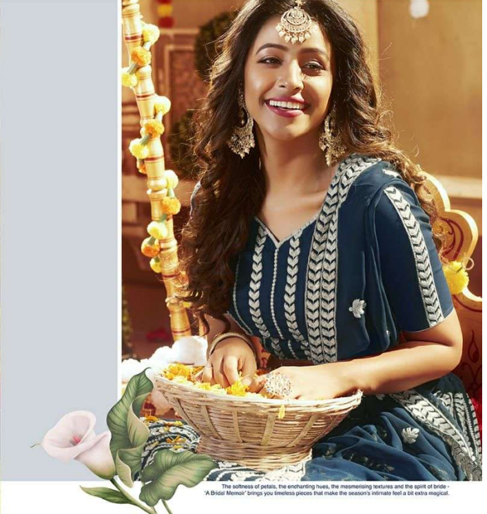
The softness of petals, the enchanting hues, the mesmerising textures and the spirit of bride - 'A Bride's Memory' brings you timeless pieces that make the season's intimates feel a bit extra magical.