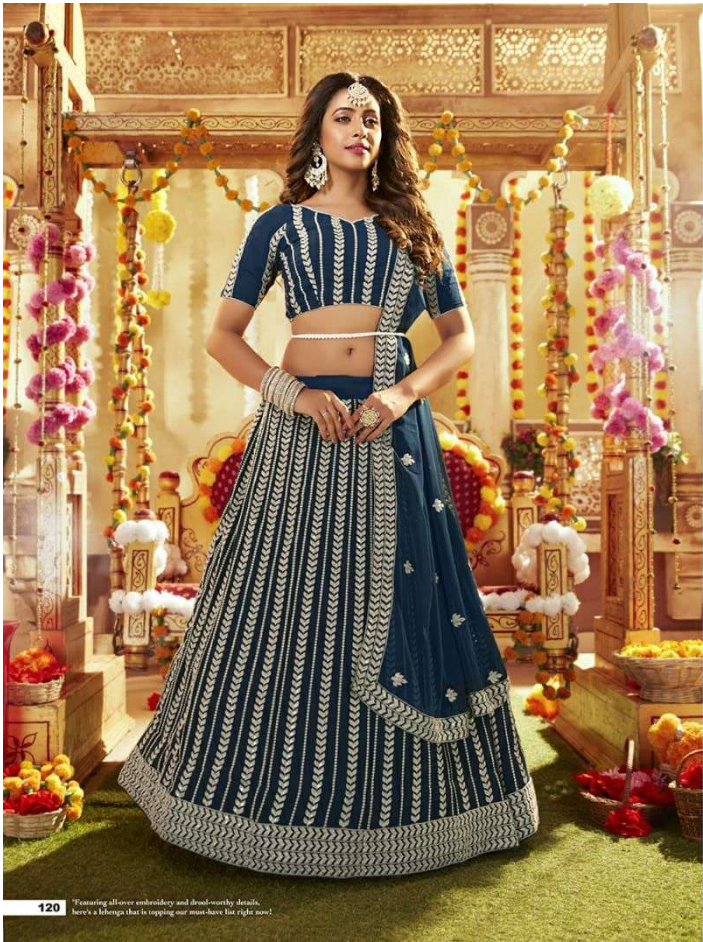
120 Featuring all-over embroidery and dream-worthy details, here's a lehenga that is topping our must-have list right now!

Wispy Wonders: Classics with a contemporary twist are always top picks!