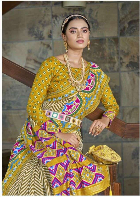
welcome to the new age of style in indian garments where an unmatched designs, designs and beautiful feeling of fabrics