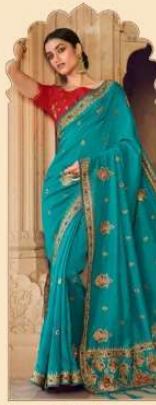
• 2309 •