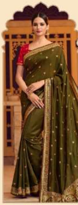
• 2303 •