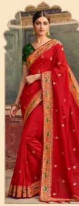
• 2310 •