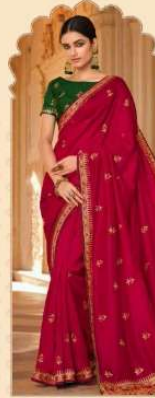
• 2315 •