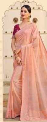
• 2311 •