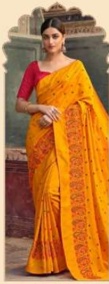
• 2304 •