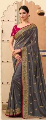
• 2307 •