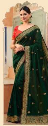
• 2311 •