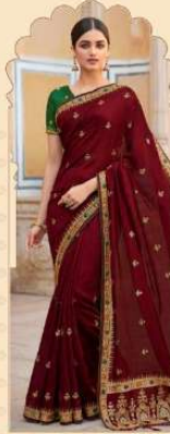
• 2308 •