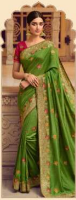
• 2302 •