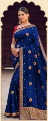
• 2305 •