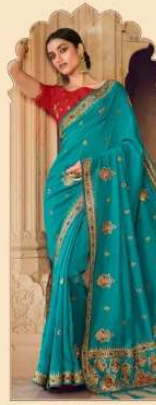
• 2309 •