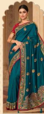
• 2313 •