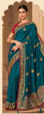
• 2313 •