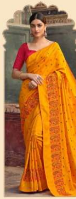
• 2304 •