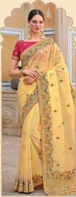
• 2306 •