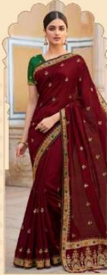
• 2308 •