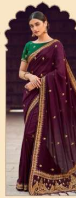
• 2312 •