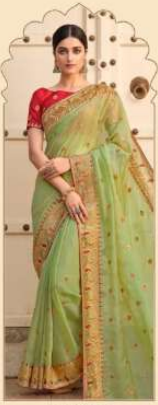
• 2301 •