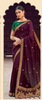
• 2312 •