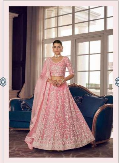
In a world full of trends, I want to remain a classic 9409