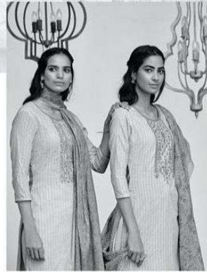
{FABULOUS AT EVERY AGE}