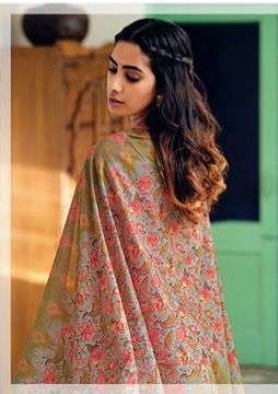
5009 [QUEEN IN STYLE]