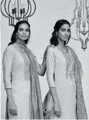
{FABULOUS AT EVERY AGE}