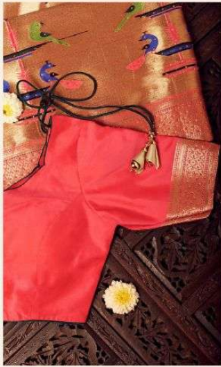
GALARI SILK PANTHANI PALEO SAREE WITH SWARGOPRI WORK ON IT. HAVING DOUBLE-BEFORE CONCEPT PINK SILK BLOUSA AND SECOND KAMA EMBROIDERED BICHUSE