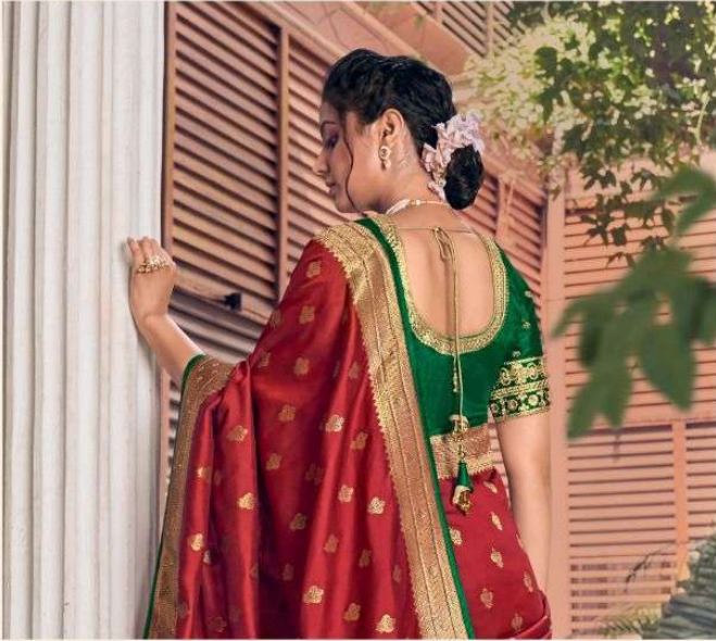
MAROUN SER-CATTIAMI PALLU SAREE WITH SHARDYERI WORK ON IT. HAVING DONATEE BUDGE CONCEPT. FIRST SERE BUDGE AND YESINO GREEN (EMBROIDERED SHOUNE)