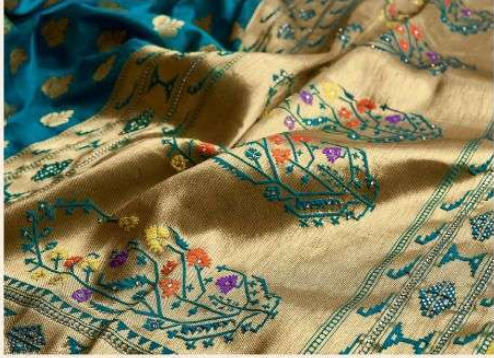
FIRST SILK PANTHANI PAJLI SAREE WITH SWAROVSKI WORK ON IT. HAVING DOUBLE KALSA CONCEPT. FIRST SILK BLOUSE AND SECOND MUSTARD EMBROIDERED BLOUSE.