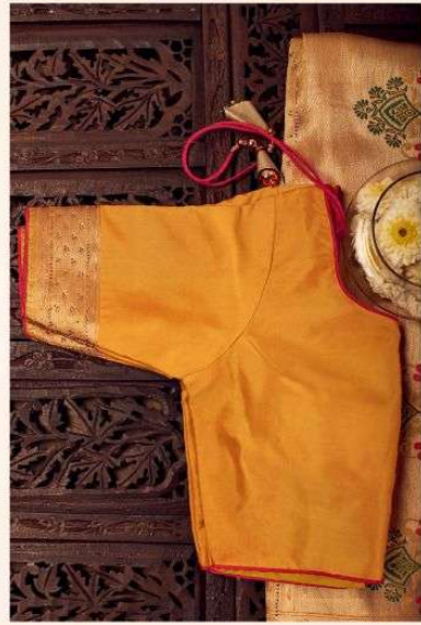
MUSTARD SILK PACHHANI FALGU SAREE WITH SWAROVSKI WORK ON IT. HAVING DOUBLE BOUND CONCEPT. FIRST SILK BOUND AND SECOND RANI EMBROIDERED BOUND.