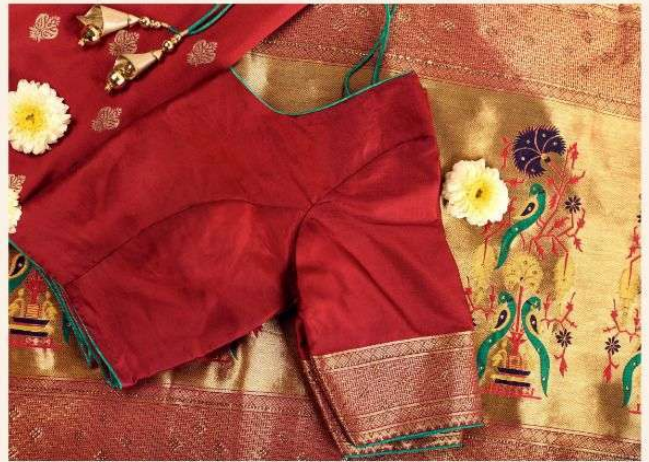
BAROON SIK PATRIANI TALU SAREE WITH SHARDA'SI WORK ON IT. HAVING DOUBLE BLOUSE CONCEPT. FIRST SILK BLOUSE AND SECOND GREEN EMBROIDERED BLOUSE.