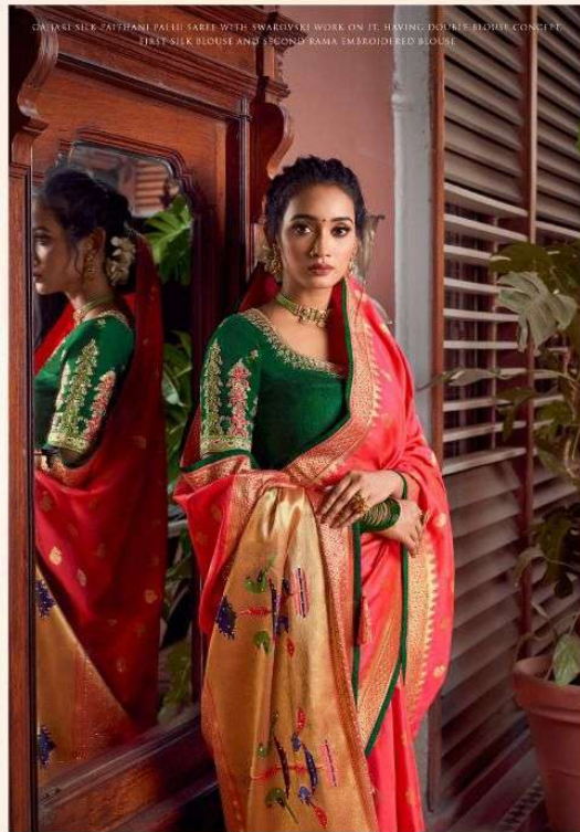
CHAMPUSIK ZATTHANI PALHI SAREE WITH SWARGVAKI WORK ON IT, HAVING DOUBLE BLOUSE CONCEPT FIRST SILK BLOUSE AND SECOND KAMA EMBROIDERED BLOUSE