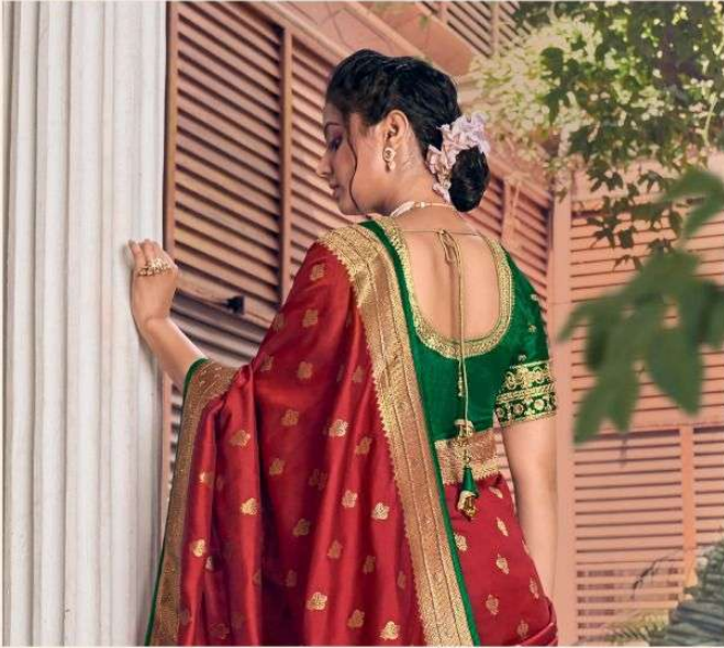
MAROUN SER-CATTUAMI PALLU SAREE WITH SHARDYERI WORK ON IT. HAVING DONATEE BISHDI CONCEPT. FIRST SER BISHDI AND YESINO GREEN (EMBROIDERED SHOUNI)