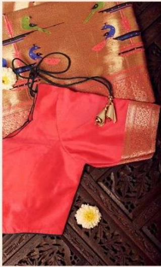
GALARI SILK PANTHANI PALEO SAREE WITH SWARGOPRI WORK ON IT. HAVING DOUBLE-BEDDING CONCEPT FABR SILK BLOUSE AND SECOND KAMA EMBROIDERED BLOUSE