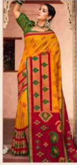
• 1909 •