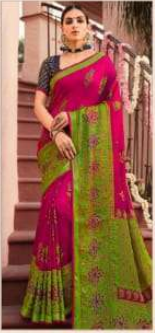
• 1907 •