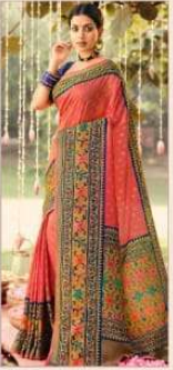
• 1908 •