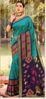
• 1904 •