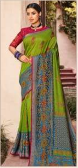
• 1906 •