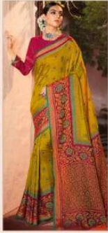
• 1914 •