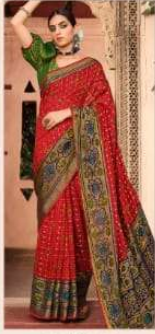
• 1910 •