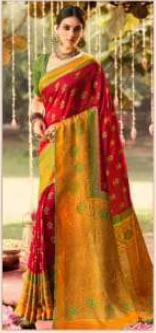
• 1905 •