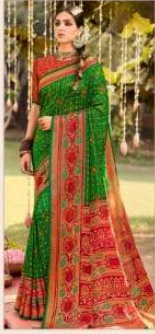
• 1912 •