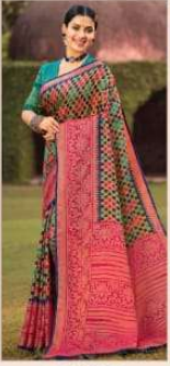
• 1903 •