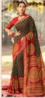
• 1913 •