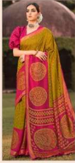
• 1911 •