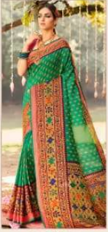
• 1901 •