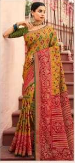
• 1902 •