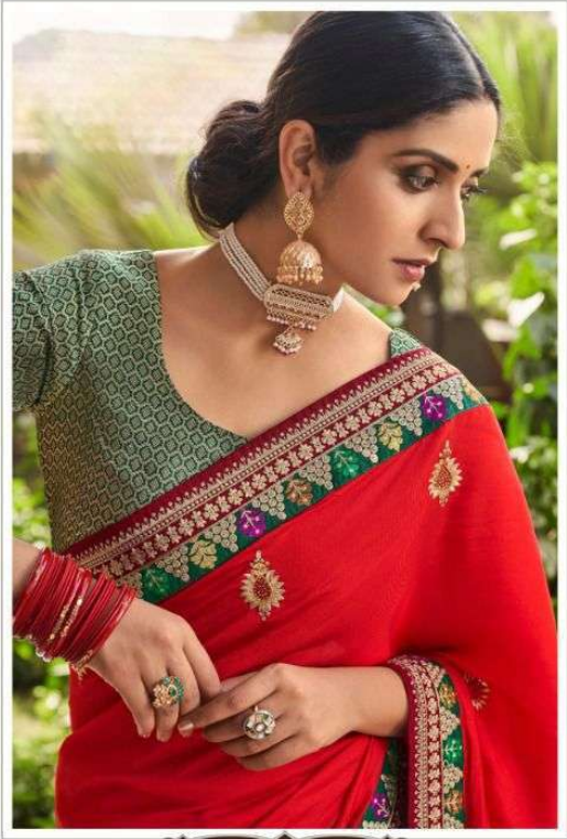
RED BANFI SILK EMBROIDERED SAREE, HAVING EMBROIDERED LACES AND TUSSELS, PAIRED WITH GREEN BROCADE BLOUSE.