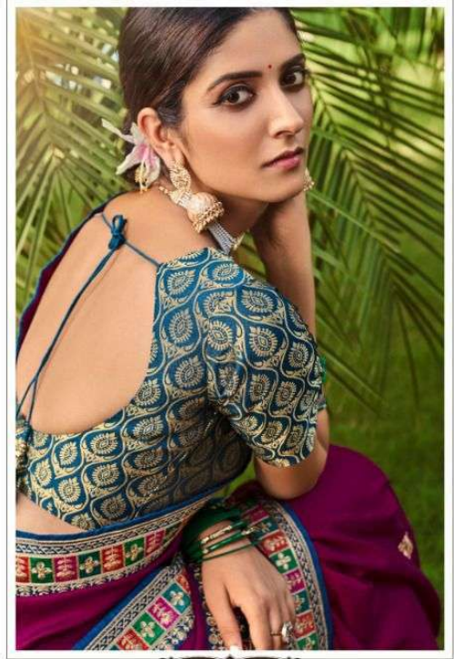
WINE BAHU SILK EMBROIDERED SAREE, HAVING EMBROIDERED LACES AND TUSSELS, PAIRED WITH PEACOCK BLUE BROCADE BLOUSE.