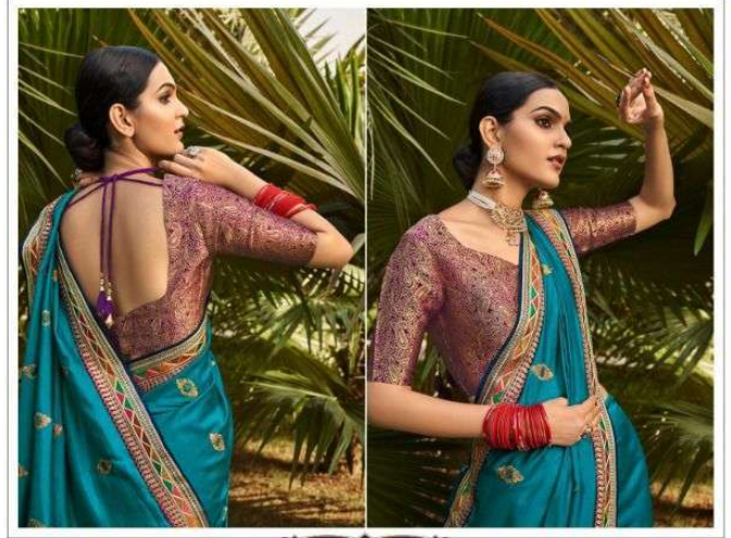
FEROZI BARFI SILK EMBROIDERED SAREE, HAVING EMBROIDERED LACES AND TUSSELS, PAIRED WITH WINE BROCADE BLOUSE