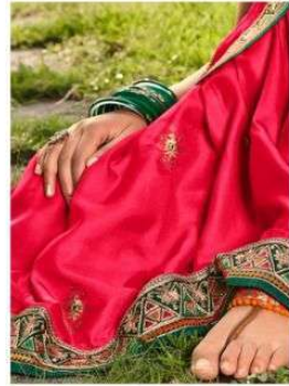
RANI BARFI SILK EMBROIDERED SAREE, HAVING EMBROIDERED LACES AND TUSSELS, PAIRED WITH GREEN BROCADE BLOUSE