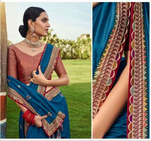
PETROL BLUE SARFI SILK EMBROIDERED SAREE, HAVING EMBROIDERED LACES AND TUSSELS. PAIRED WITH RED BROCADE BLOUSE