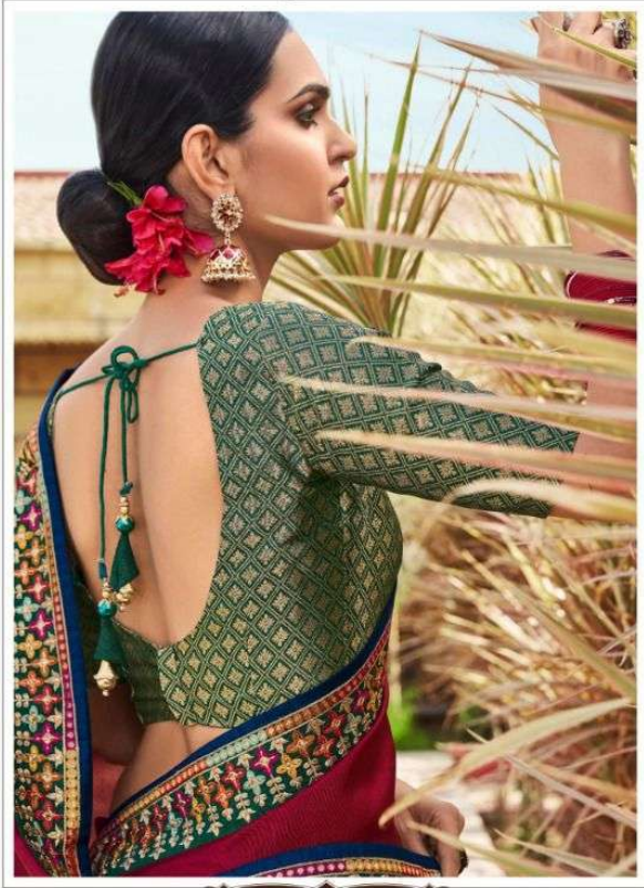
MAROON BARFI SILK EMBROIDERED SAREE, HAVING EMBROIDERED LACES AND TUSSELS, PAIRED WITH GREEN BROCADE BLOUSE