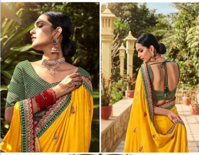
MUSTARD BARFI SILK EMBROIDERED SAREE, HAVING EMBROIDERED LACES AND TUSSELS, PAIRED WITH GREEN BROCADE BLOUSE.