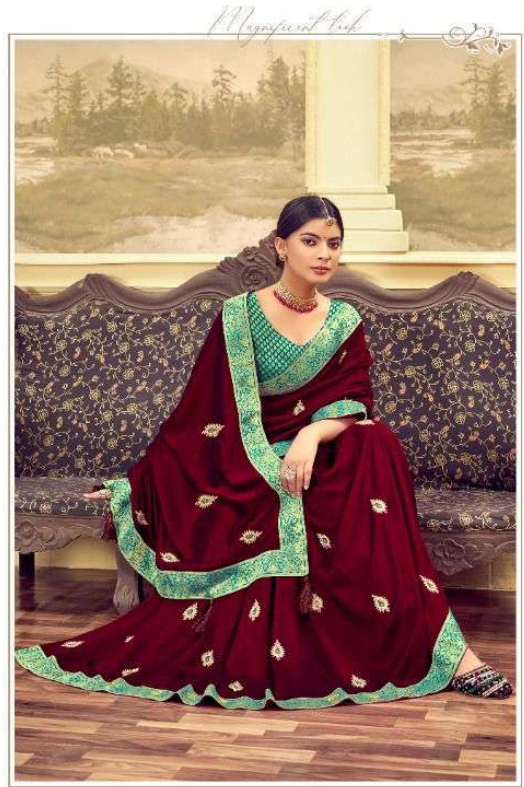
BLOOMING URNE VICHITRA SILK SAREE WITH EMBROIDERED BUTTIES AND SHAROVSKI HAYING BROCADE BORDER WITH SHAROVSKI LOGO AND FUSSEL PAIRER-SITE-RAMA SHIKHAR-ALOUSE