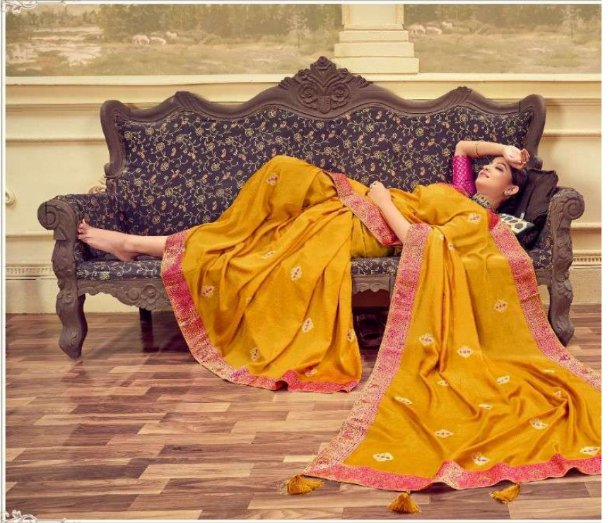
BLOOMING MUSTARD VICHITRA SILK SAREE WITH EMBROIDERED BUTTIES AND SWAROVSKI, RAYING BROCADE BORDER WITH SWAROVSKI WORK AND TUSSELS, PAIRED WITH RANI BROCADE BLOUSE