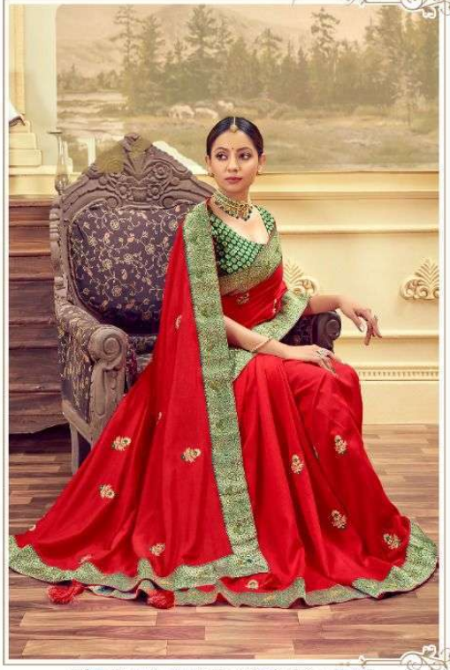
BLOOMING RED VICHITRA SILK SAREE WITH EMBROIDERED BUTTIES AND SBAROYSEL HAVING BROCADE BORDER WITH SHARONKAI WORK AND TUSSELS. PAIRED WITH GREEN BROCADE BLOUSE