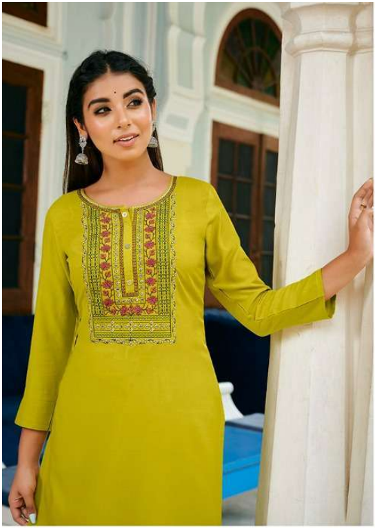
A TASTE OF FASHION — GRACEFUL —