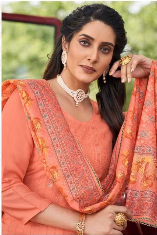
Embrace one of the purest trends this season.