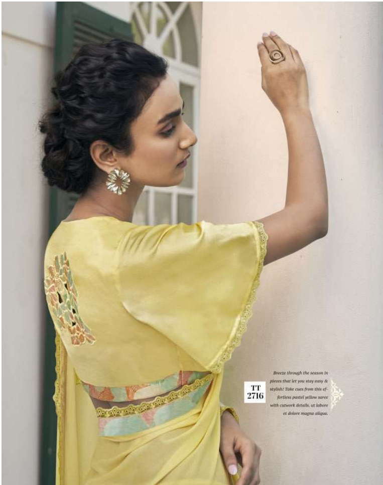
TT 2716 Breeze through the season in pieces that let you stay easy & stylish! Take cues from this effortless pastel yellow saree with cutwork details, ut labore et dolore magna aliqua.