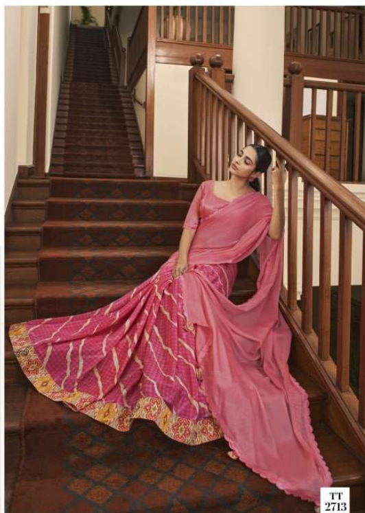
The classic peach in soothing chiffon is a minimalistic choice for balmy days. Wear an arrangement of mogrus that calls for a celebration that is YOU.