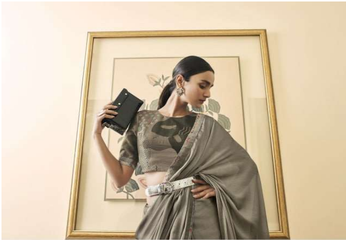
Artistically printed blouse and natural hue saree: what do you get? The perfect looks for cocktail parties and soirées!