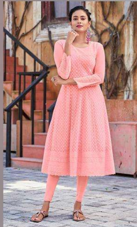
... 1004 ...