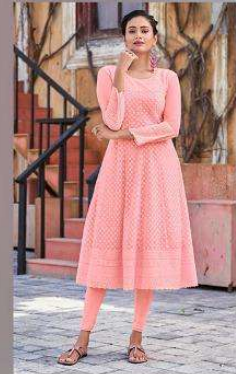
... 1004 ...