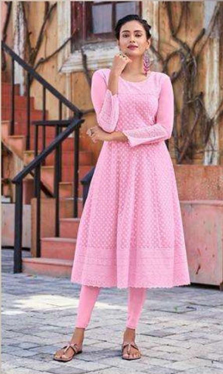
... 1001 ...