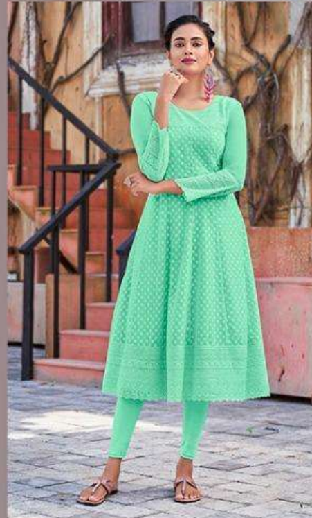
... 1002 ...