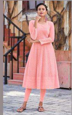
... 1004 ...