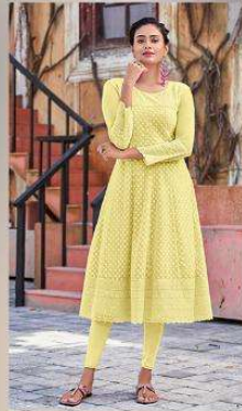
... 1003 ...