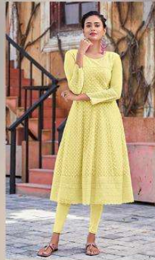
... 1003 ...