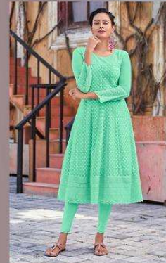
... 1002 ...