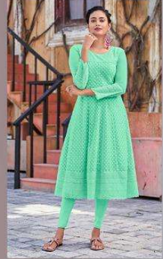
... 1002 ...