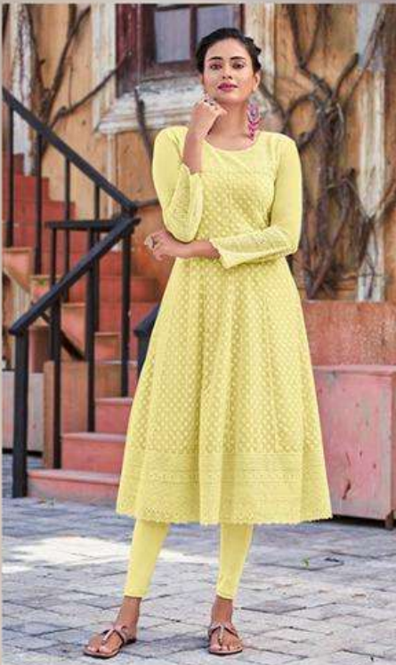
... 1003 ...