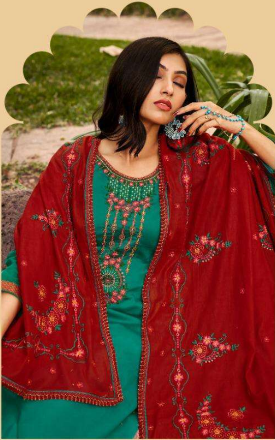
Add an oomph factor to your wardrobe with the "crossing" in "dress" collection crafted for stylish women.