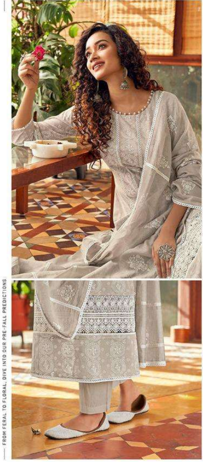
FROM FERAL TO FLORAL. DIVE INTO OUR PRE-FALL PREDICTIONS