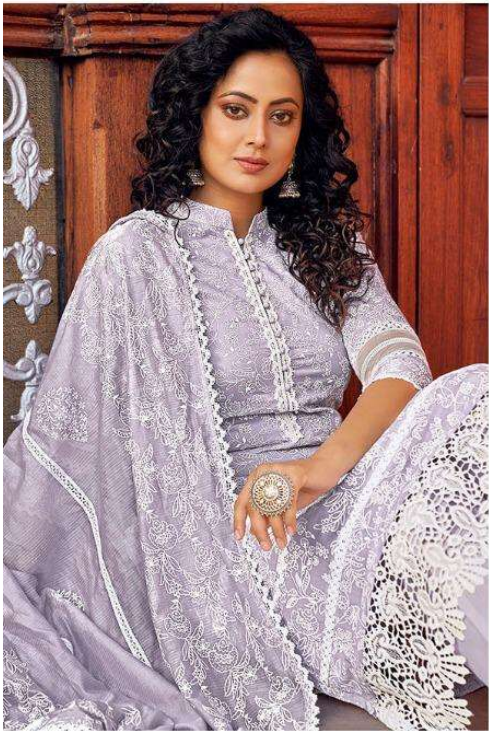
SATIAE YOUR FLORAL LOVE WITH THIS ELEGANT AND CLASSY PIECE WHILE YOU CHECK OUT THIS LOOK BOOK.