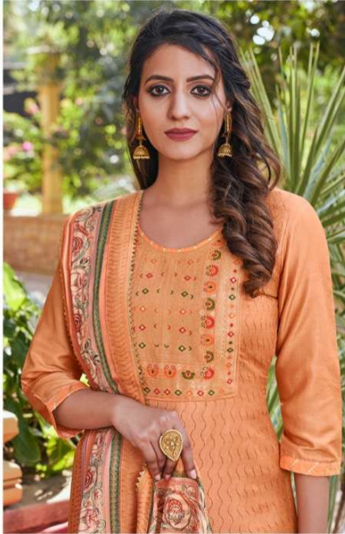
Classic styles with luxurious soft fabrics are highlighted by elegant and feminine details.