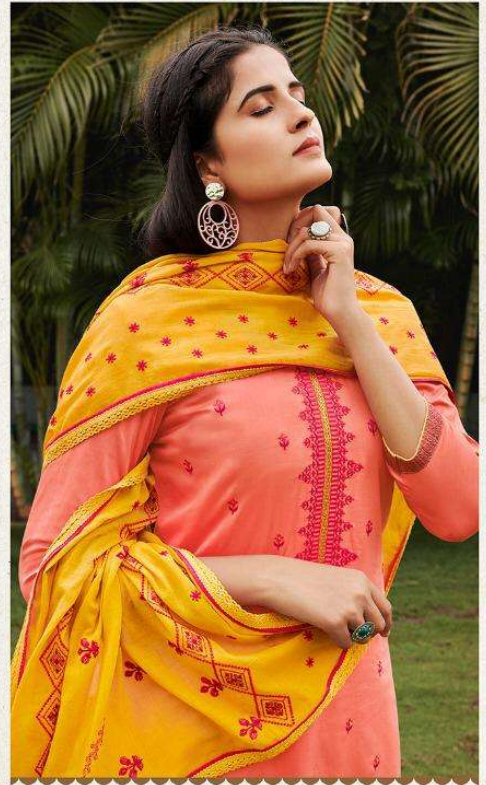
The collection was a perfect blend of Indian silhouettes & contemporary style. 5528-