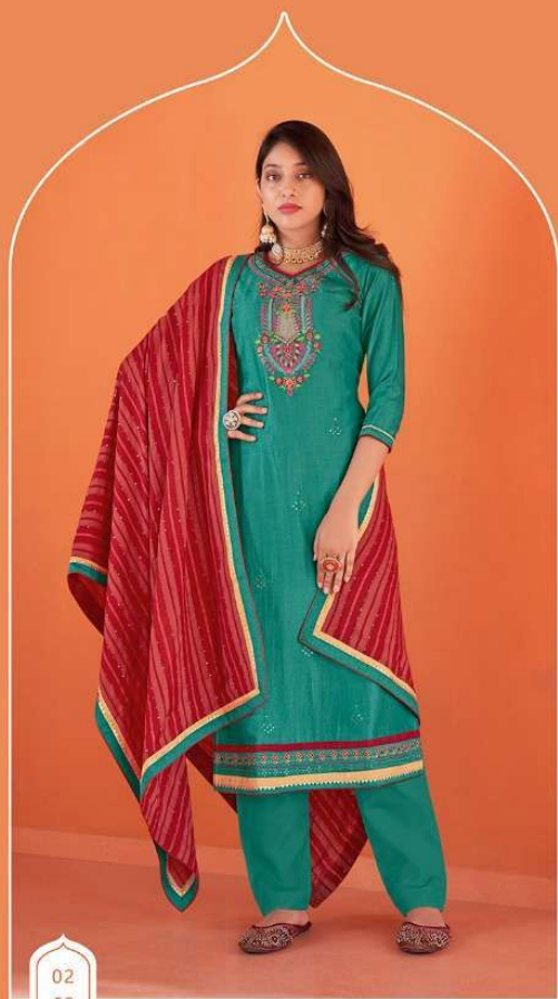
❖ Made in India, with love by the designers