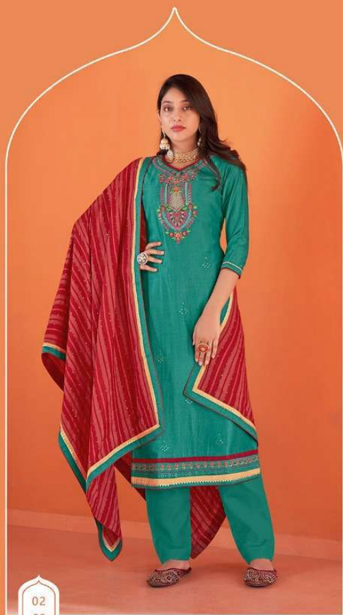
❖ Made in India, with love by our designers