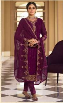
◆ 12261 ◆