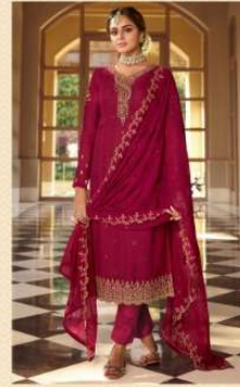
◆ 12265 ◆