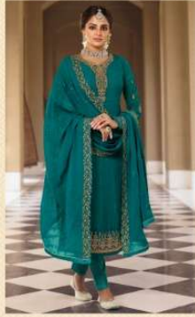
◆ 12264 ◆