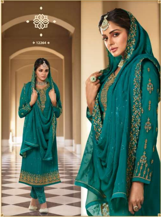
Make your daily wardrobe much more eye-pleasing.