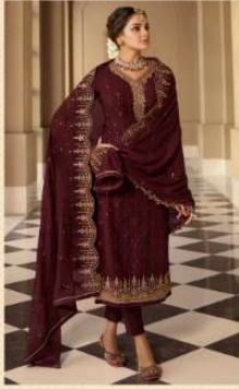
◆ 12263 ◆