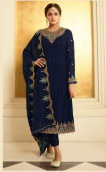
◆ 12262 ◆