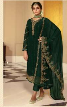
◆ 12266 ◆