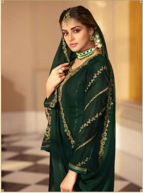
Elegant suit sets with utmost comfort and style.