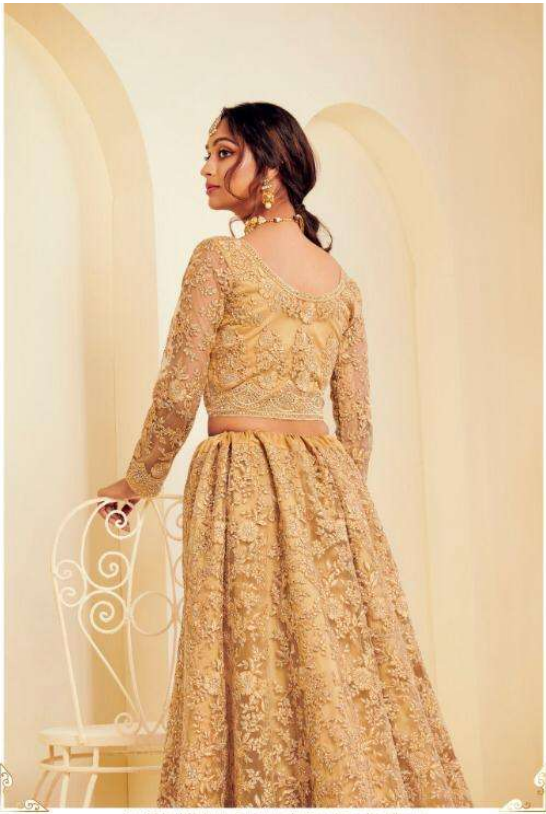
Light fabric, bold pattern & voluminous draping adorn modern silhouettes.