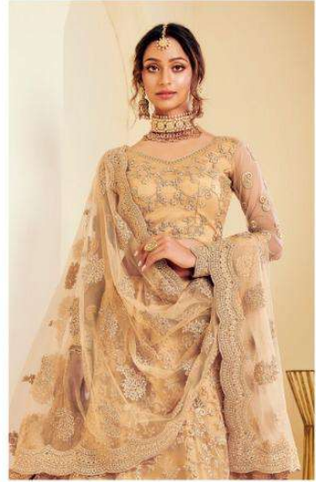
The contemporary design for the fashion conscious woman while preserving the traditional art and culture of India. 1001-E