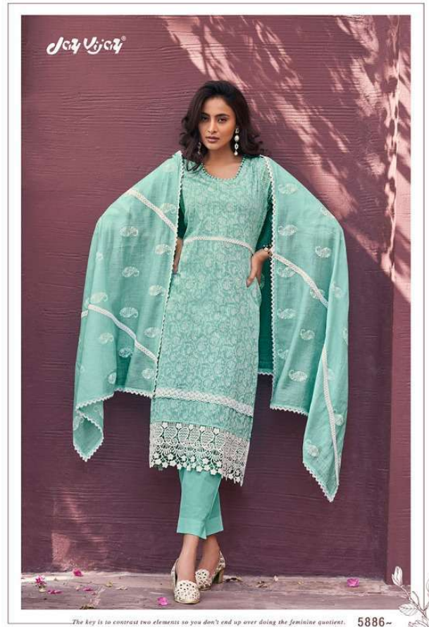
The key is to contrast two elements so you don't end up over doing the feminine quotient. 5886-