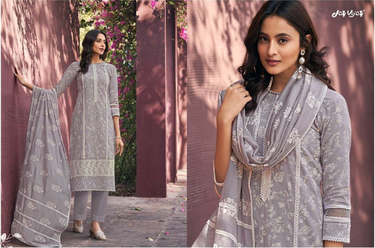
5883 Simple without letting go of elegance & tradition with natural fabrics.