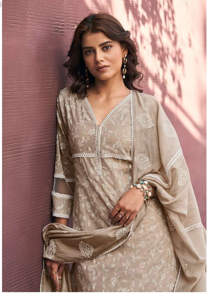
5884 A scintillating plethora of timeless masterpiece inspired by beauty from Indian culture.