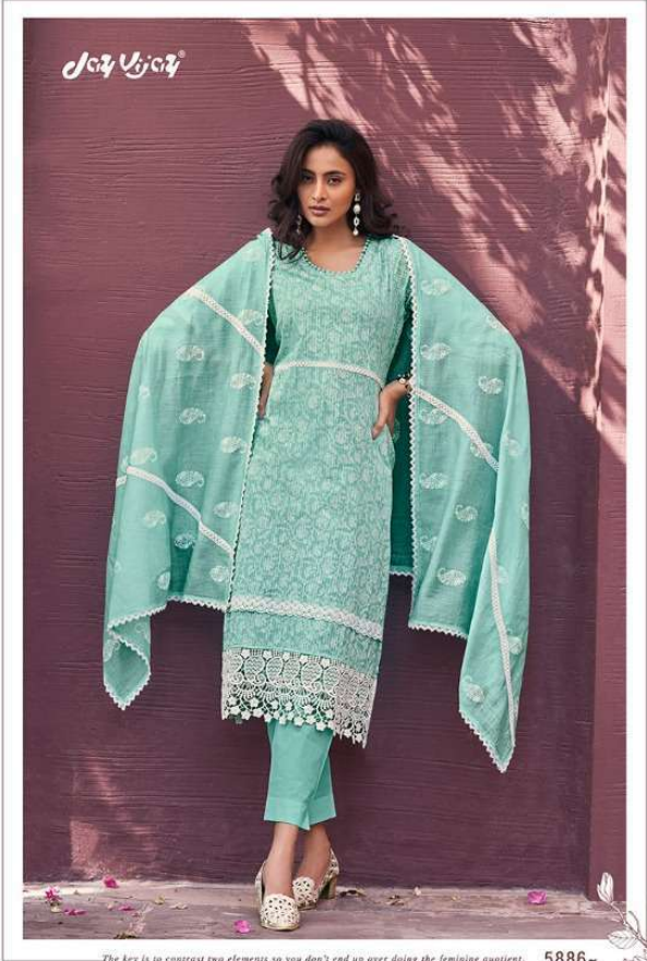
The key is to contrast two elements so you don't end up over doing the feminine quotient. 5886-