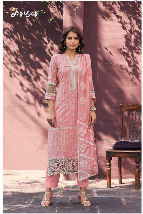
5887 ~Flowers are the pattern of spring summer 2021~