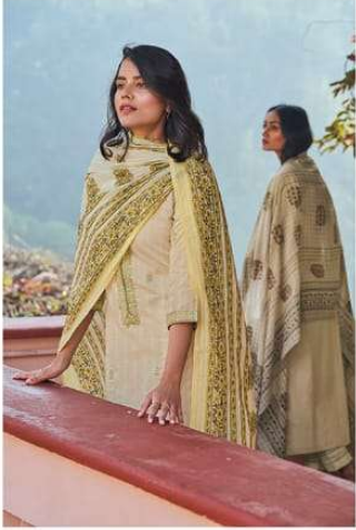
Bring out the ethnic side in you with grace