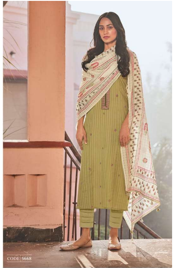
Turn an high style and class with this elegant piece