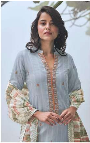
Sometimes you don't have to try too hard to look different.