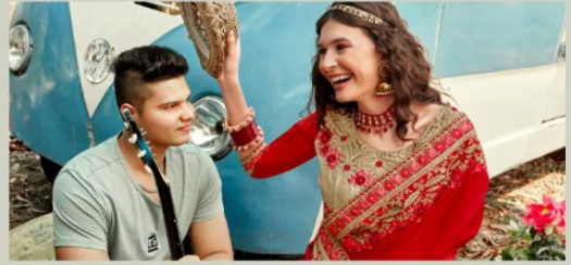
Escape the prison of Cliche fashion and play with the contemporary fashionable array.