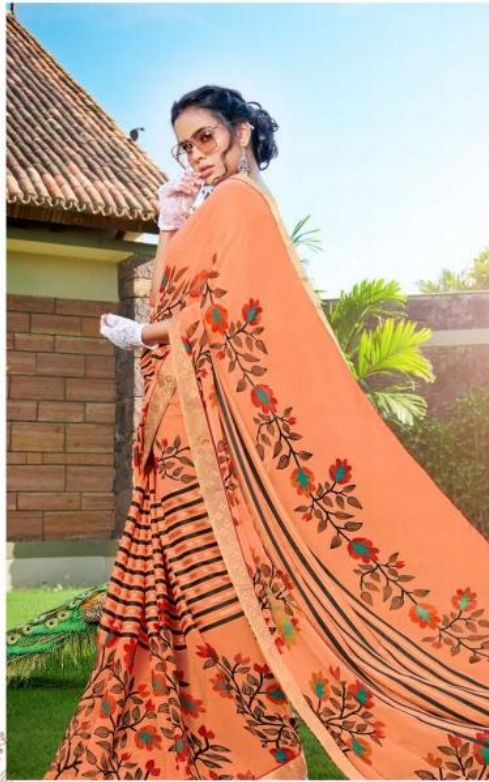
THE CONTRAST SHADES MINED UP TO OVER DO THE FEMININE QUOTIENT

ALLOW THE PAISLEYS TO CROWD YOUR WARDROBE ON CONTRAST SHADES