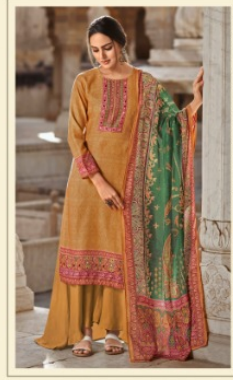
◆ 504 ◆