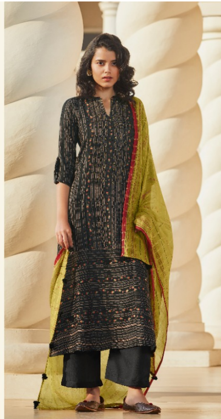
Strut in the SUNSHINE with CONFIDENCE Allow time to COMMAND your wardrobe 5623