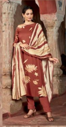
DESIGN | 862