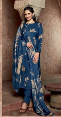
DESIGN | 893