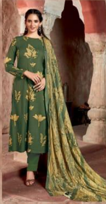
DESIGN | 820