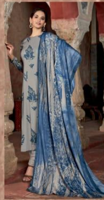
DESIGN | 832