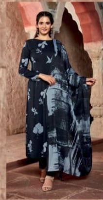
DESIGN | 875