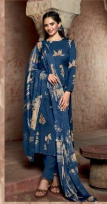
DESIGN | 893