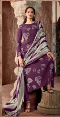
DESIGN | 821