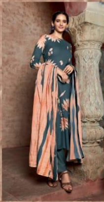
DESIGN | 879