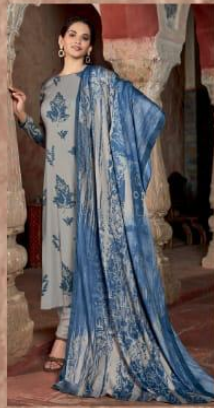
DESIGN | 832