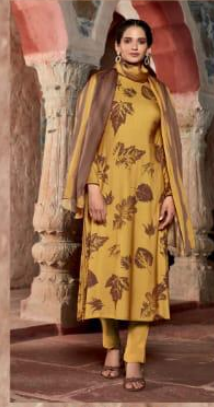
DESIGN | 898