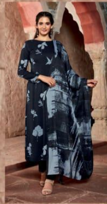
DESIGN | 875