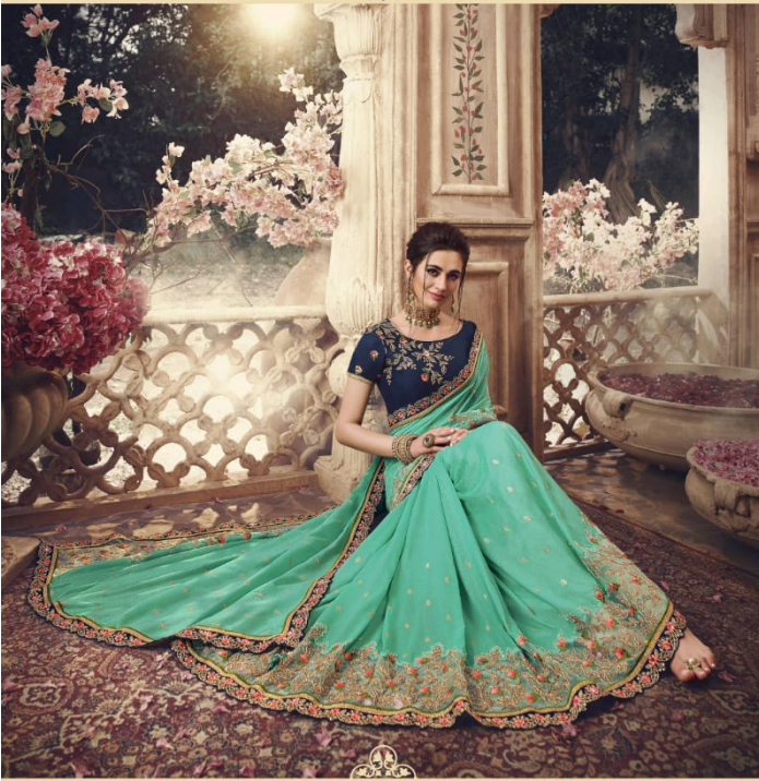
FERIDI HANDLOOM SILK SAREE WITH FERIDI NET ATTACHMENT WITH DELICATE EMBROIDERY ON IT PAIRED WITH BLUE RAW SILK BLOUSE • 1070 •