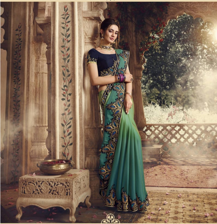
PEACOCK GREEN SILK GEORGETTE SAREE WITH BEAUTIFUL PEACOCK FEATHER LACE ON NAVY BLUE VELVET PAIRED WITH NAVY BLUE RAW SILK BLOUSE • 1068 •