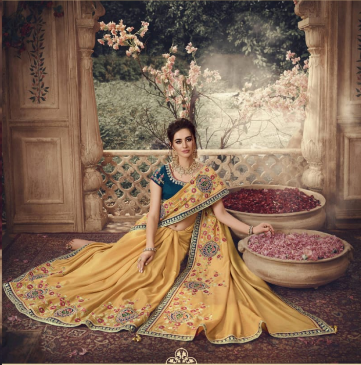
MAROON SILK SATIN SAREE HAVING PEACH APPLIQUE WORK WITH DELICATE EMBROIDERY ON IT PAIRED WITH MAROON BAN SILK BLOUSE