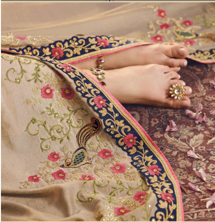
BEIGE HANDLOOM SILK SAREE HAVING BLUE VELVET PATCH WORK AND ZARI WORK ON IT PAIRED WITH BLUE RAW SILK BLOUSE • 1072 •