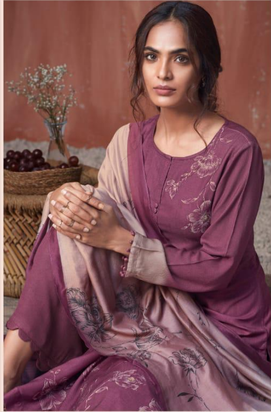
WINTER Flowers /396