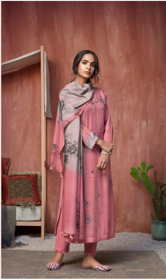
WINTER Flower /345