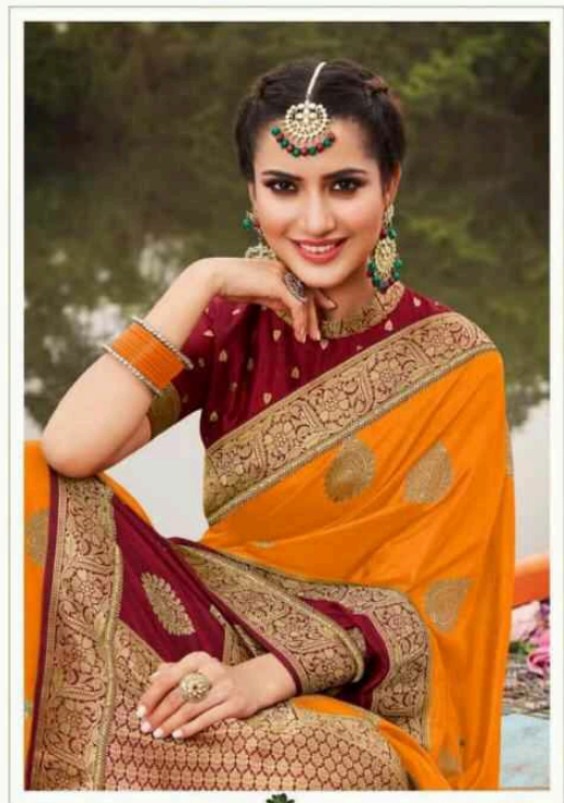
The glimmer is something which will fulfill all the requirements for glimmer if really look.