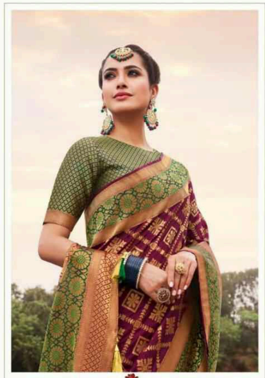
everything you need to refresh your classic wardrobe this season begins in the calm tones of the season.