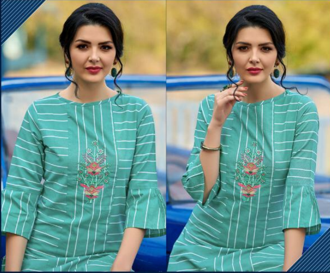
◆ DESIGN NUMBER.1005◆

DESIGN IS A CONSTANT CHALLENGE TO BALANCE COMFORT WITH LUXE, THE PRACTICAL WITH THE DESIRABLE