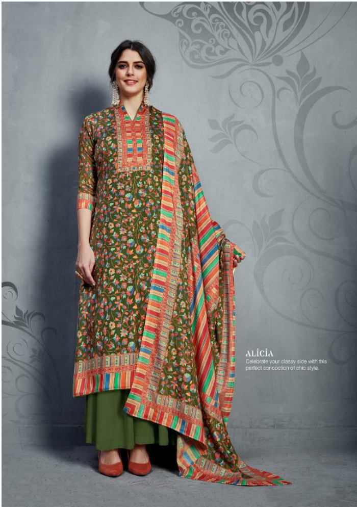
Alicia Celebrate your classy side with this perfect concoction of chic style.