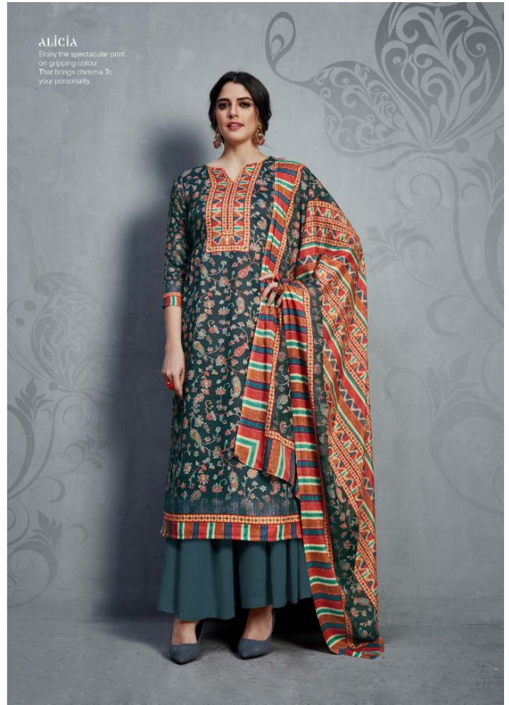
Alicia Enjoy the spectacular print on gripping colour That brings christmas To your personality.