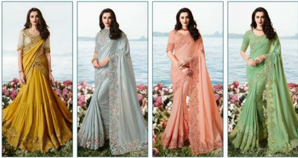
◆ 6205 ◆