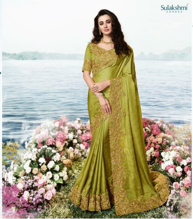
You are undoubtedly the magnificence of heritor with these magnetic, shades and pink combination embellished with delicate work details.