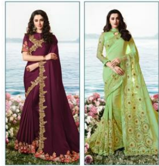
◆ 6213 ◆