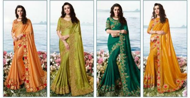
◆ 6209 ◆