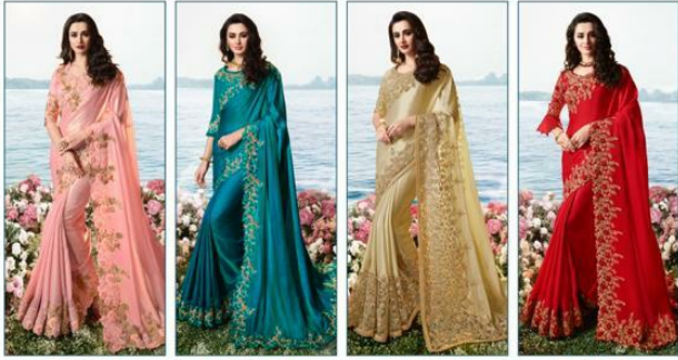
◆ 6201 ◆