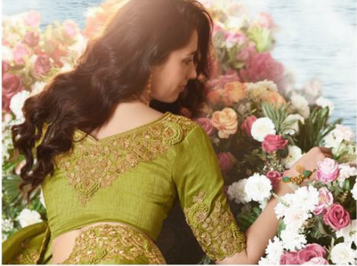
You are undoubtedly the magnificence of her for with these magnetic, shades and pink combination embellished with delicate work details.